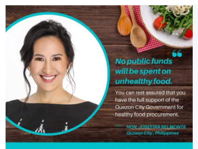
QUEZON CITY HEALTHY PUBLIC FOOD PROCUREMENT

The QC government issued a press release that was picked up by the People's Television Network (PTV4) and reposted by other news sites and blogs. Internally, memorandums were issued to all QC offices and departments, including one from the City Budget Department, notifying staff of the requirement to incorporate the new nutrition guidelines for food procurement in PPMPs.