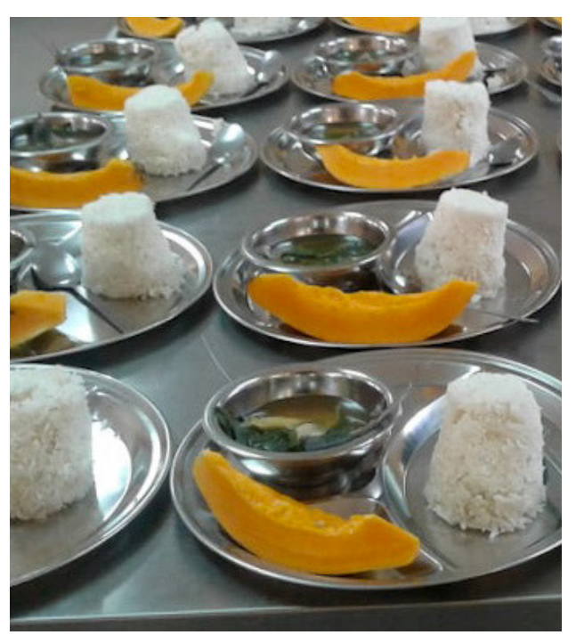
at the Molave Youth Home

About 81,000 of these deaths are attributed to dietary risk factors. With 2.9 million people, Quezon City (QC) is the most populous city in the Philippines. It is committed to combatting NCDs, as part of the C40 Cities Climate Leadership Group and Partnership for Healthy Cities. To promote a healthy and sustainable diet, the city initiated the development of a healthy food procurement policy in 2020, with two aims: First, to develop and pilot a model healthy public food procurement policy for QC; and second, to secure a national endorsement of the policy that prompts local government units (LGUs) to implement it nationwide and use the model policy as the basis of a national policy.